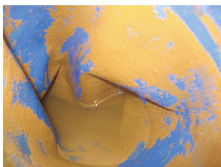
CalcClear treatment softening foulant without chemicals