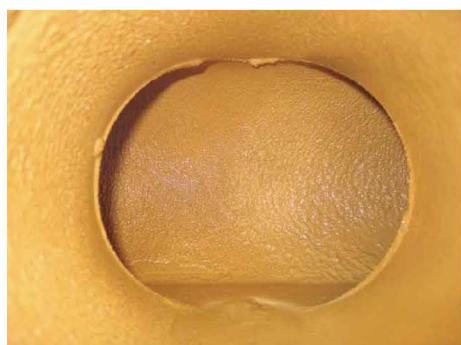
Layflat coated in iron foulant